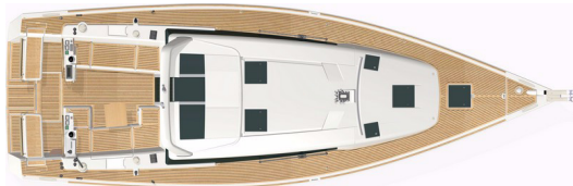
2 cabins - 1 Head